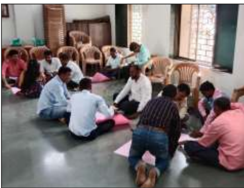
Workshop on Food Sovereignty