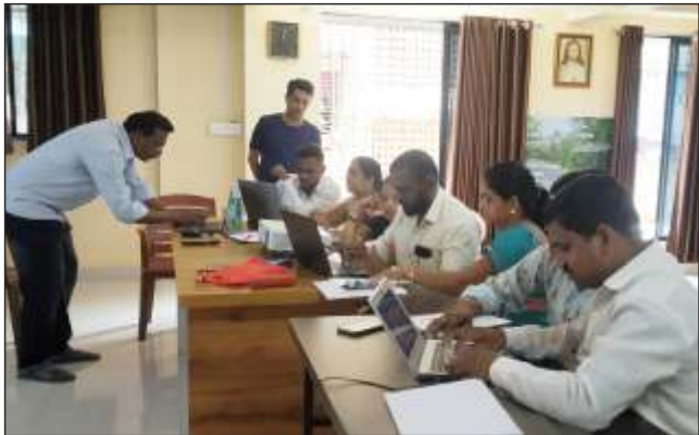
Effective Report Writing & Documentation