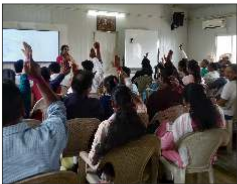
Juvenile Justice Act