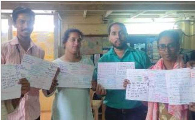
Training on Leadership