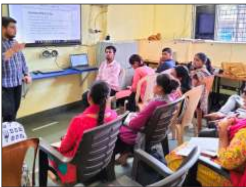
Basic Computer Training