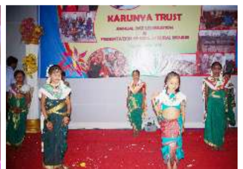
A Wonderful Performance by Gyansaathi & Bharari Children